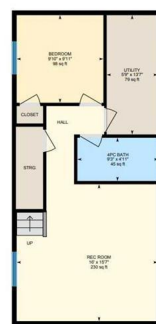
Basement (Below Grade) Exterior Area 613.13 sq ft