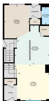
Main Floor Exterior Area 895.87 sq ft

Main Building: Total Exterior Area Above Grade 1351.40 sq ft