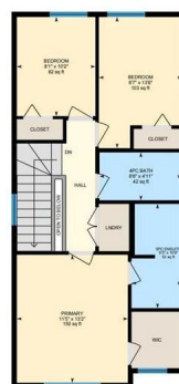
2nd Floor Exterior Area 554.53 sq ft