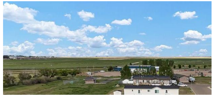
127 Meadowplace Dr E, Brooks, AB

Main Floor Exterior Area 1517.55 sq ft Interior Area 1381.31 sq ft