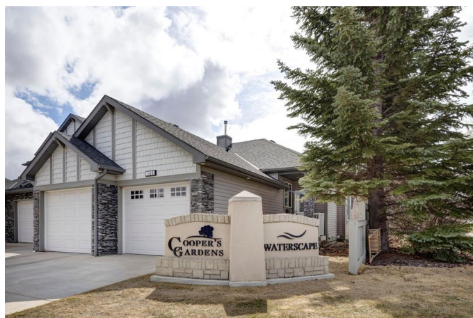
160-100 Coopers Common SW, Airdrie, AB

Refaced cabinet doors and drawers gleam in the kitchen, where a sleek moveable island invites culinary creativity. Hardwood flooring has been extended to flow seamlessly from the main living areas into the kitchen and two bedrooms, creating a cohesive, polished look. The main floor is a masterclass in functionality, with the kitchen leading to a spacious dining room, while the living room beckons with a cozy gas fireplace and patio doors that frame the deck's inviting views. A practical mudroom/laundry area connects to the double attached garage, ensuring convenience. Retreat to the primary bedroom, complete with a walk-in closet and a 3-piece ensuite, or host guests in the second bedroom with easy access to another full bathroom. Downstairs, possibilities abound. A spacious recreation room, bathed in natural light from two large windows, sets the stage for movie nights or game days. A third bedroom and full bathroom offer flexibility for guests or family, while an unfinished hobby space or workout room awaits your personal touch. Enjoy year-round