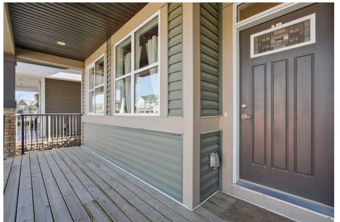
41 Legacy Glen Row SE, Calgary, AB

Main Floor Exterior Area 758.08 sq ft Interior Area 691.29 sq ft