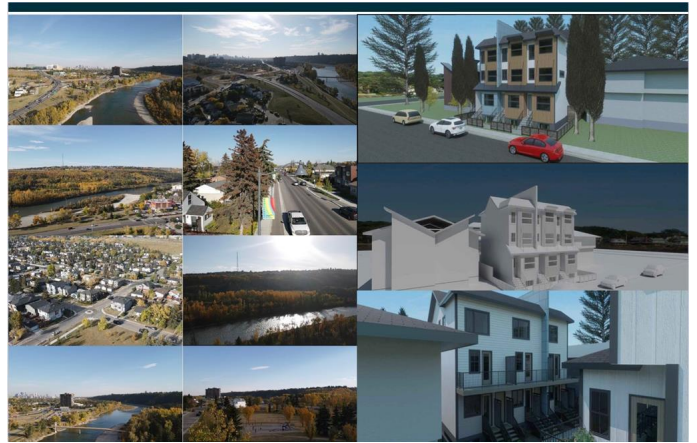
THE PLOT OF LAND : VISUALIZING YOUR NEXT PROJECT HERE

Seize this remarkable chance to acquire a prime MU-1 50 X 120 lot and bring your vision to life with the construction of the following Mixed-use building- a multi-story structure with commercial spaces on the ground floor and residential units above, creating a lively street atmosphere while addressing housing needs. Consider developing a series of townhouses or row houses, offering affordable options for families and individuals in a mixed-use setting. Live-work units- Design innovative spaces that blend residential living with commercial functions, perfect for professionals looking to operate a business from home. Small Retail or Office Space- Construct a boutique retail or office space to support local businesses, caf  s, or professional services, enhancing the community's economic landscape. Explore the possibility of creating facilities for community services, such as a daycare, community center, or health service center, that would greatly benefit local residents. Montgomery is a thriving neighborhood with an array of amenities just a short walk away, including shopping at Market Mall, a diverse selection of restaurants, and the scenic Bowness Park along the Bow River. Additionally, you  ll have quick access  whether by transit or vehicle  to the majestic Rocky Mountains, Canada Olympic Park, Winsport, the University of Calgary, and both the Children  s and Foothills Hospitals. The area is experiencing a surge of new families and positive growth.